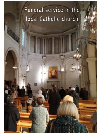
Funeral service in the local Catholic church

grandfather was surprised to hear me speak of Christ, because we had the ceremony in a funeral home and not in a church. It never crossed my mind not to speak of Him, since He is our living hope!