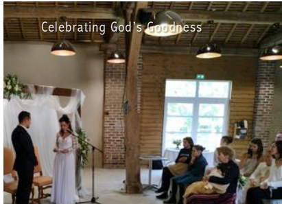
Celebrating God's Goodness

Discipling and counseling. As someone has said: "Missions is messy!" It sure is, but when God does something beautiful, it changes everything. One person from an abusive and emotional unstable background had a major breakthrough this summer, as she learned to abandon herself solely to her Heavenly Father. Every relationship was on shaky grounds as she hoped incessantly for approval and feared rejection. As a result, her own father reached out to her, and even pronounced the very words her soul longed for for: "I love you." Their relationship has taken a new and healthier dimension. The life of Christ is restoring people indeed!